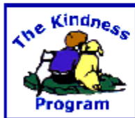
The Beatrice Watson-Acheson Foundation

A special thank you to Miller Waste for sanding the lane leading to the shelter after one of the many storms this past winter thus ensuring that the animal care workers and volunteers were able to stay on the lane.