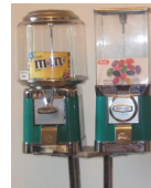
CANDY DISPENSING PROGRAM