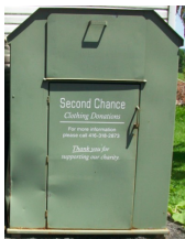
USED CLOTHING DROP BOX

We gratefully accept Canadian Tire Money!