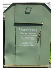
USED CLOTHING DROP BOX

We gratefully accept Canadian Tire Money!