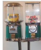
CANDY DISPENSING PROGRAM