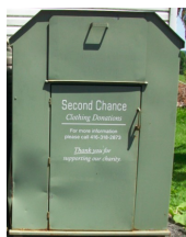
USED CLOTHING DROP BOX

We also gratefully accept Canadian Tire Money!