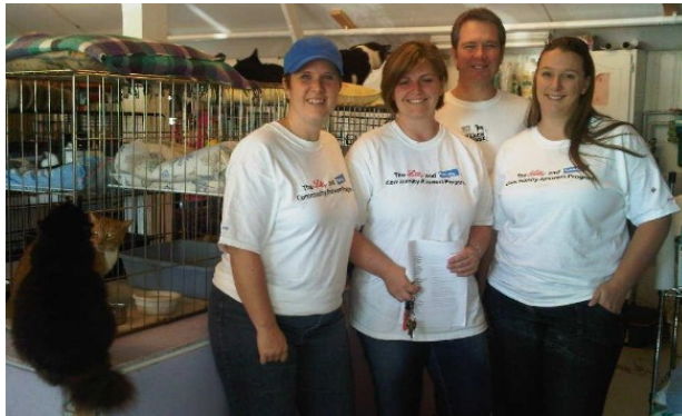
Eli Lilly Volunteers