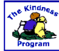
The Beatrice Watson-Acheson Foundation