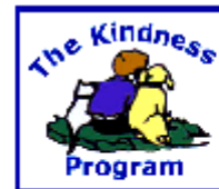
The Beatrice Watson-Acheson Foundation