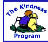
The Beatrice Watson-Acheson Foundation